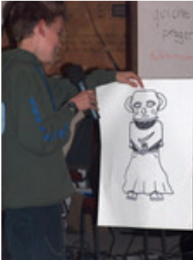
A proposed uniform for the holy order.

October 22nd was the start of our "Hungry for the Word" weekend. We run the weekend in partnership with Underground, the youth wing of Open Doors, who are also our partner in the website